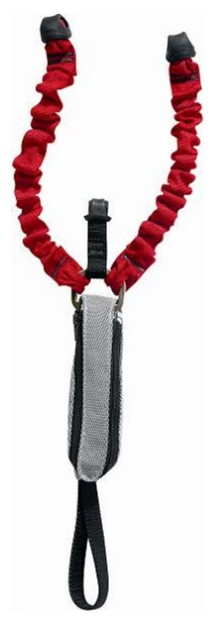
SCORPIO L60 2005 to Present