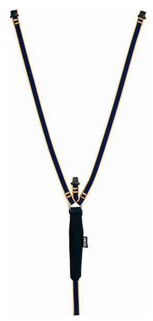
SCORPIO L60 2002 to 2005