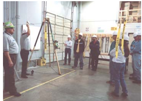
Classroom instruction (top) includes helping workers understand basic construction terms, while hands-on training focuses on job skills.