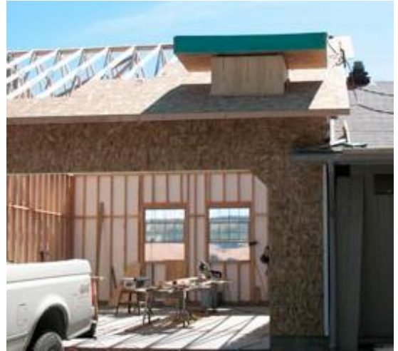
Example of Plywood Table: Image from Bonnefin Studios (with permission)

Our safety talk today is about a construction worker who died after a stack of 30 sheets of plywood crushed him. The victim was standing 4 to 5 feet up on a ladder helping to set up a stack of plywood on the roof when the stacked wood began to slide down onto him. The victim started down the ladder, but the plywood landed on him in two sections. Heavy equipment was used to remove the plywood while another person called 911. The victim was conscious just after the incident, he said that he thought his back was broken and could not move his hands or feet. The victim later died at the hospital.