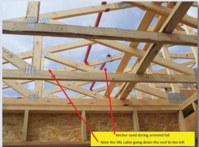
Anchor used during arrested fall Note the SRL cable going down the roof to the left