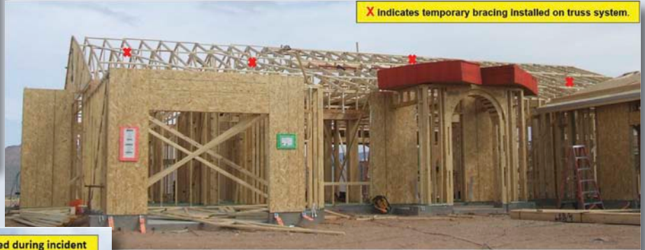
X indicates temporary bracing installed on truss system.