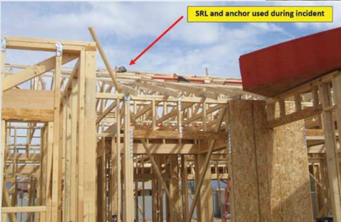
SRL and anchor used during incident