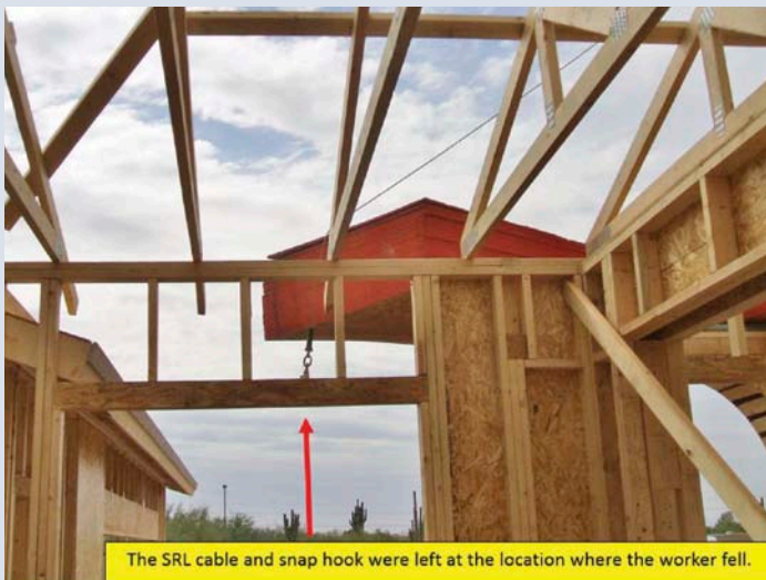
The SRL cable and snap hook were left at the location where the worker fell.