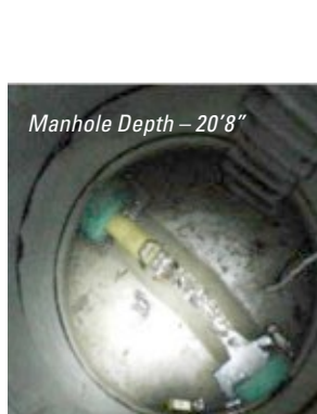
Figure 1: Photo of manhole

Incident type: ..... Confined space asphyxiation Weather conditions: ..... Sunny, 61-67°F Type of operation: ..... Sanitary sewer system installation Size of work crew: ..... 4 Worksite inspection conducted: ..... Unknown Competent safety monitoring on site: ..... No Safety and health program in effect: ..... No Training and education for workers: ..... No Occupation of deceased worker: ..... Foreman/Operating Engineer Age/Sex of deceased worker: ..... 46/M Time on job: ..... 15 years Time at task: ..... Less than 1 hour Employment classification (FT/PT/Temporary): ..... Full time Language spoken: ..... English Union/Non-Union: ..... Union