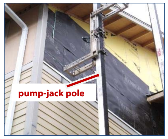
Figure 1 (above). Breezeway, pump jack pole. Figure 2 (below). Breezeway, 3<sup>rd</sup> floor stair landing with temporary railing.

A 46-year-old owner of a small residential siding company died from injuries sustained when he fell approximately 20-25 feet from a pump-jack scaffold platform onto a concrete slab. The company was a subcontractor hired to install siding on a newly constructed apartment building. The work was being performed using pump-jack scaffolding. On the day of the incident, the siding subcontractor was installing siding in a breezeway. He and his crew erected the scaffold. However, to work around the concrete stairs and related structures in the breezeway, they used only one pump-jack pole and used the stair landing to support the other end of the scaffold platform. To raise the platform above landing height they placed a stepladder on the landing, and would raise the pumpjack pole on the other side. The siding company owner was working alone at the time of the incident. He apparently was attempting to use a second stepladder placed on top of the scaffold platform to access a high peak above a 3<sup>rd</sup> floor landing, when he fell to the concrete slab at the bottom of the breezeway. A nearby worker called 911. Emergency responders arrived minutes later and transported the injured siding company owner to a hospital trauma center, where he died the following day.