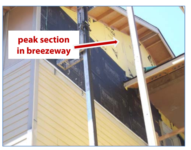
Figure 4. Peak section of breezeway wall.

According to OR-OSHA observations and information obtained through interviews, building wrap and siding had been installed on two lower levels. The crew recalled seeing that the platform was level as the work progressed to the third level. To complete the top section siding required gaining additional height to reach the triangle shaped roof peak area above the third level landing (see Figure 4). It was assumed that to do this, the victim had placed a 6-foot step ladder on top of the scaffold platform. The victim was working alone at the time of the incident, and was not using fall protection. The three siding crew members who been assisting earlier in the day had been