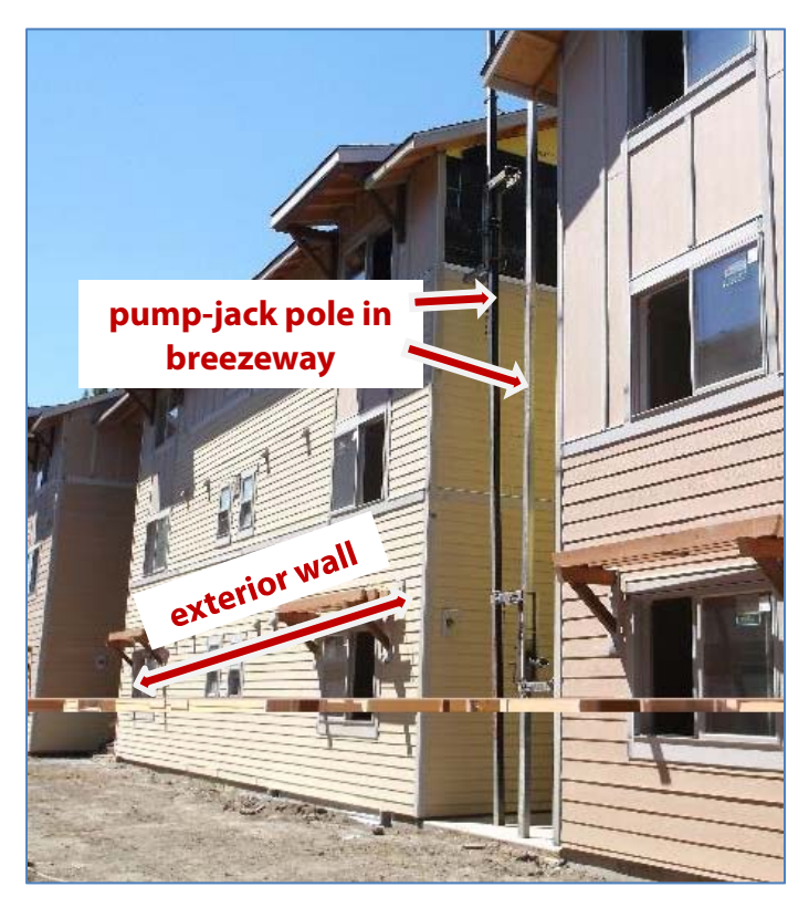
Figure 3. Exterior wall and breezeway.

in turn hired several siding companies (including the company owned by the deceased) to perform the work over the course of the project. Construction work at the site had begun about nine months prior to the incident. The worker who was fatally injured had been working daily at this site for approximately two months at the time of the incident. Building and roofing construction was complete. Interior work was still underway in various stages of completion, and several specialty trades were working inside the buildings at the time of the incident.