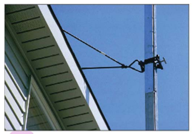
Figure 5. Example of scaffold pole properly secured to building (from OR-OSHA publication, "Supported Scaffolds").