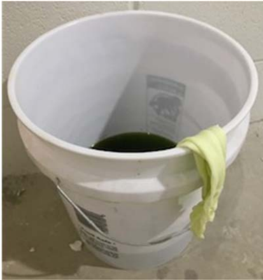
Bucket with disinfectant for tool cleaning