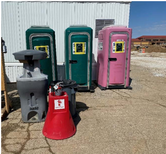
Hand washing stations were added to Port-o-let locations