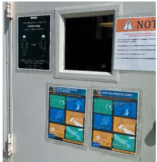
Signs were installed sites – such as this sign on a trailer door for 6' distancing and controlling the spread of COVID 19