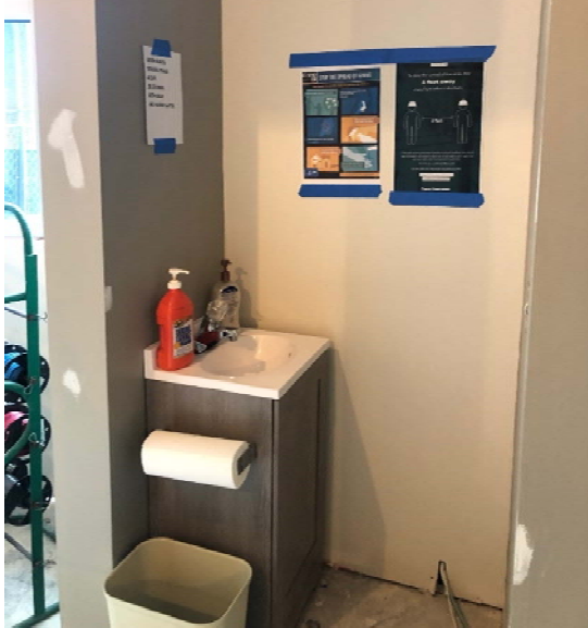
Temporary sinks were installed on all jobsites for hand washing