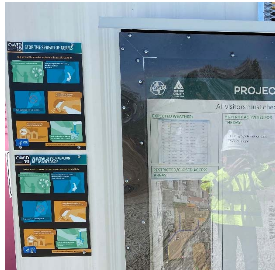
Controlling the spread of COVID 19 signs are also posted at job boards