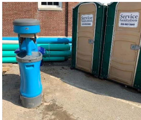
Hand washing stations were added to Port-o-let locations