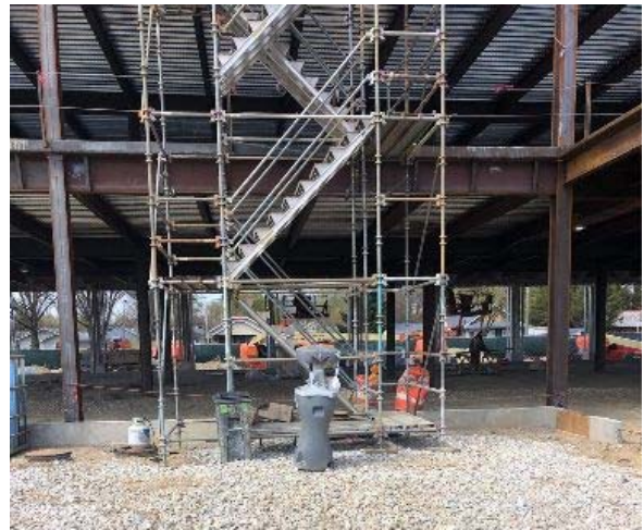
Hand washing stations added to high traffic location