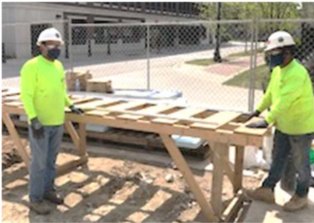
Tradespeople wearing face protection