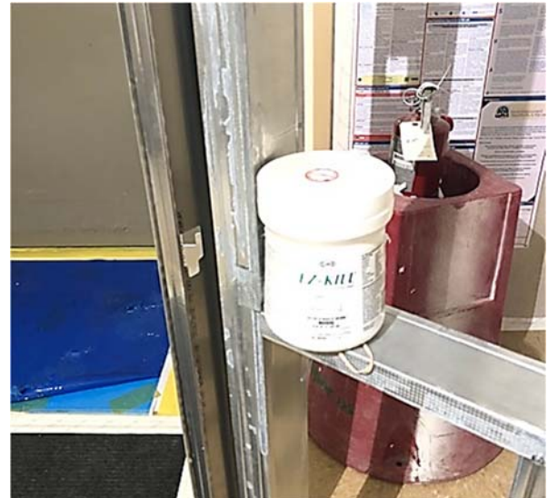
Cleaning wipes positioned at entry to workspace