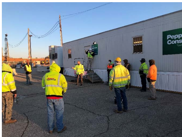
Small group meetings held on projects to explain COVID prevention efforts while maintaining social distancing