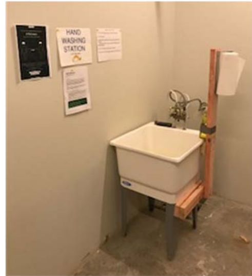
Temporary hand washing station