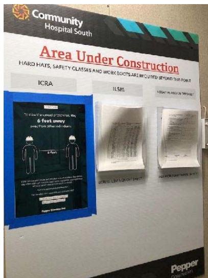
Six-foot social distancing signs are installed on all jobsites