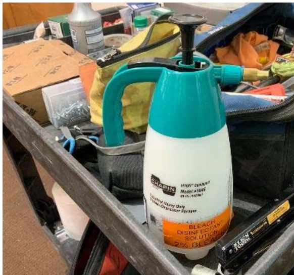
Trade partner tool cleaning apparatus – tools are wiped down after use