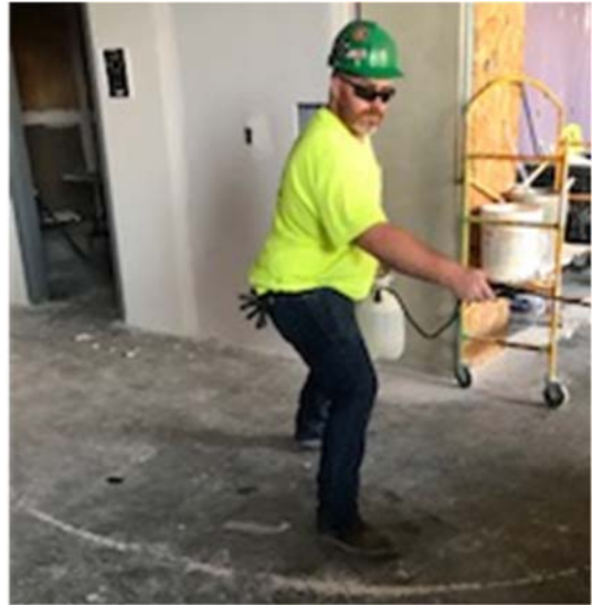
Tradespeople applying disinfectant to work areas with a sprayer