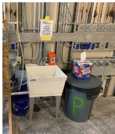
Temporary sink installed in construction area for hand washing