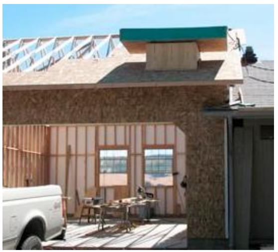
Example of Plywood Table: Image from Bonnefin Studios (with permission)

Our safety talk today is about a construction worker who died after a stack of 30 sheets of plywood crushed him. The victim was standing 4 to 5 feet up on a ladder helping to set up a stack of plywood on the roof when the stacked wood began to slide down onto him. The victim started down the ladder, but the plywood landed on him in two sections. Heavy equipment was used to remove the plywood while another person called 911. The victim was conscious just after the incident, he said that he thought his back was broken and could not move his hands or feet. The victim later died at the hospital.